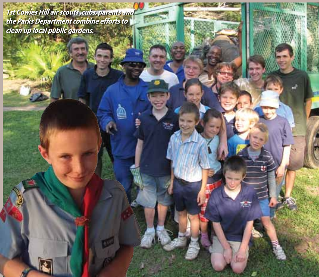
1st Cowies Hill air scouts, cubs, parents and the Parks Department combine efforts to clean up local public gardens.